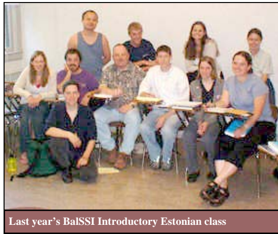
Last year's BalSSI Introductory Estonian class

pursue their Estonian professional and academic goals after completing the summer program.