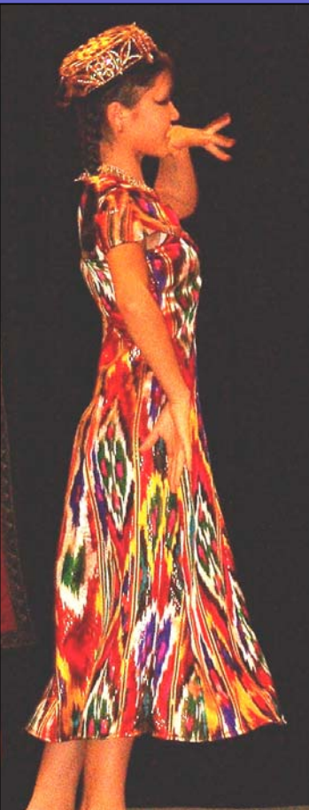
Clad in the colorful attire of her native Uzbekistan, a dancer represents her culture with a fast-paced, traditional Uzbek dance.

On March 27th, the Navruz Student Association of Indiana University once again delighted the Bloomington community with its annual celebration of spring. At this year's celebration, several hundred guests were entertained with skits, dances, music, and video presentations representing many of the cultures of Central Asia, the Caucasus and the Near East. Though they shared a common holiday, the participating groups displayed a remarkable diversity in celebrating the arrival of spring.