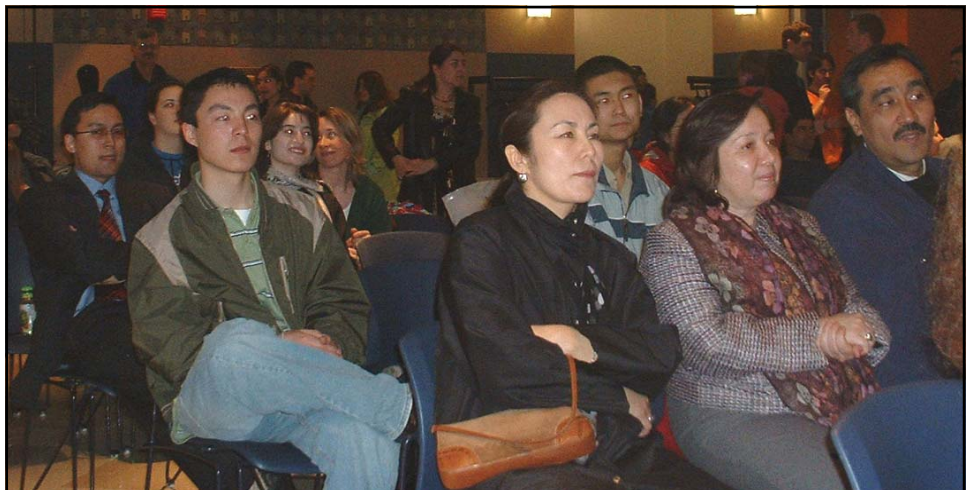
An appreciative audience at Indiana University's 2005 Navruz festival of spring