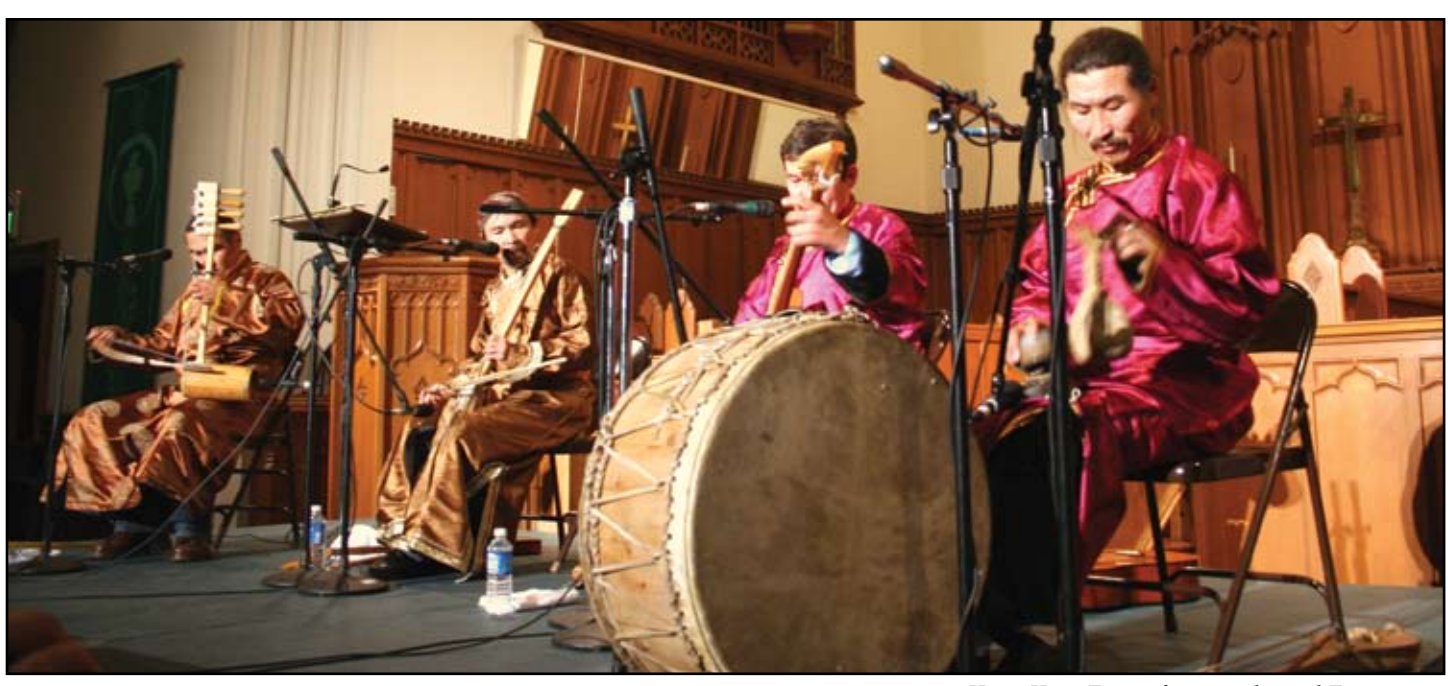
Turkish Adventure (Cont.)

In addition to the music, Lotus Festival also featured exhibitions of Tibetan and Mongolian culture sponsored by the Tibetan Cultural Center. Attendees could explore several traditional Mongol tent-like dwellings known as gers . Other items on display included two pieces of artwork often used as an aid for mediation in Tibetan Buddhism: a mandala made of colorful sand symbolically representing a Buddhist landscape and a thangka made of tiny beads depicting a Buddhist deity. Festival-goers also had the opportunity to view photographs of Tibet and Tibetan-style butter sculptures.