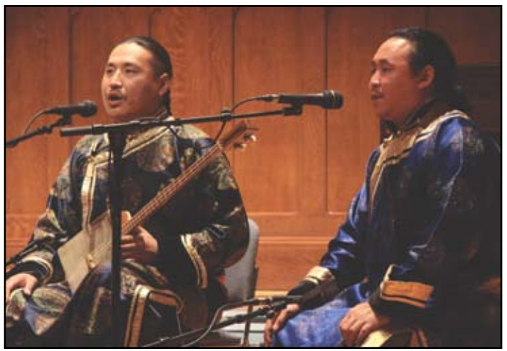
Chirgilchin performs at Lotus Festival.