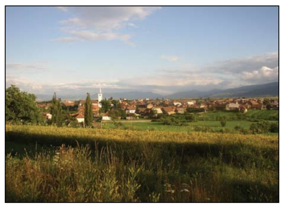
Erdely, Transylvania.

As part of our second case study, my colleagues and I chose to focus on a community of former professional ice-hockey players from the Sekler region. These former players had developed small ventures and enterprise networks in the wood industry. Studying this phenomenon, we found that these hockey players had benefited from historical circumstances which had allowed them to build extensive so-