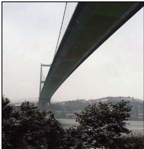
The Bosphorus Bridge in Istanbul, Turkey.

The second part consists of readings that are presented over ten chapters. The topically organized chapters feature authentic texts