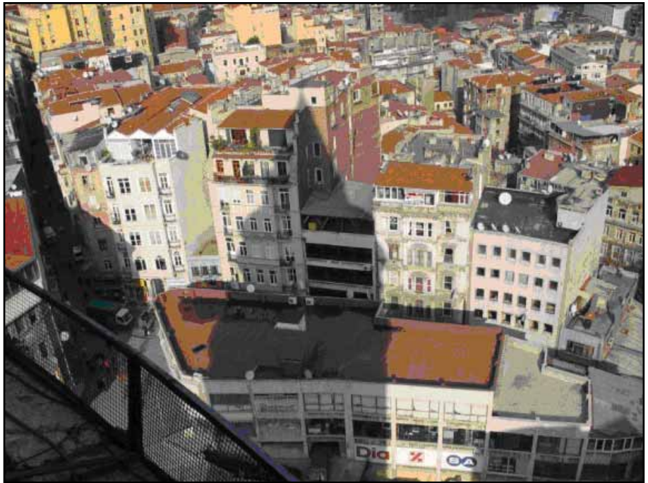
Shadow of the Genoese Galata Tower over modern Beyoğlu (formerly the "Frankish" district of Pera), Istanbul

One of the most noticeable features of "To Wake to Constantinople" is its use of the former name Konstantinopolis . This form of the name often evokes an outcry in the Turkish press because of its association with the Greek nationalist Megali Idea , i.e. "the Great Idea," that all formerly Greek lands should be united under a single Greek government. This issue, which might seem esoteric to outsiders, set off a great controversy during the 2004 Eurovision Song Contest finals in Istanbul, when the Greek Cypriot host connected to the live broadcast saying, "Good evening, Konstantinopolis." According to one report, the Istanbul host responded, "Istanbul, not Kon-