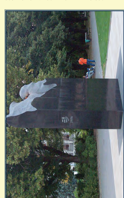
Memorial to the 1956 Revolution, Budapest, Hungary