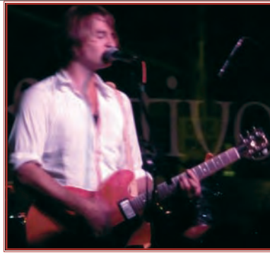
A member of Little Cow performs at Lotus Festival

More information about Lotus and the 2009 performers can be found