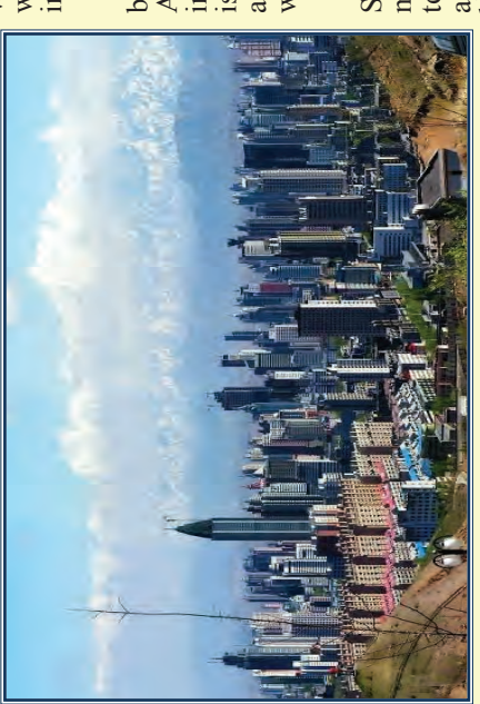
Urumqi, Xinjiang Uyghur Autonomous Region, China

Relevant Indiana Grade 7 Standards: 7.2.7, 7.2.8, 7.5.1, 7.2.9 Relevant Indiana High School Standards: GHW.3.3, GHW.5.5, GHW.7.1, GHW.10.1