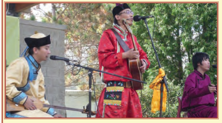
Hanggai performing at Lotus Festival

From Tuvan throat singers to Hungarian ska rockers, Central Eurasia was well represented at the 2009 Lotus Festival. A showcase of world music and art, the Lotus Festival took over downtown Bloomington, Indiana from Thursday, September 24 through Sunday, September 27. Despite a rainy forecast, large