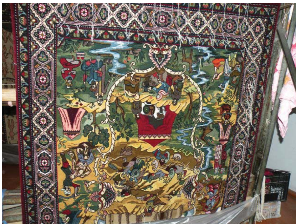
A colorful finished carpet at the Quba Women and Family Business Center, Baku