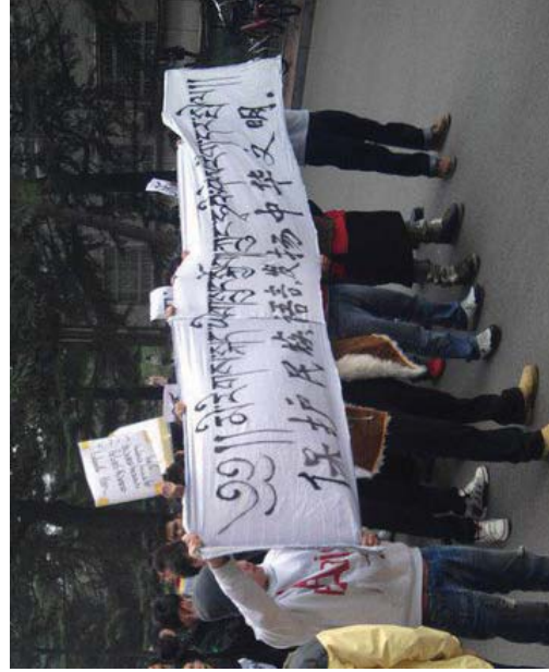
Tibetan students protest in Beijing.

Relevant Indiana High School Standards: GHW.7, GHW.10