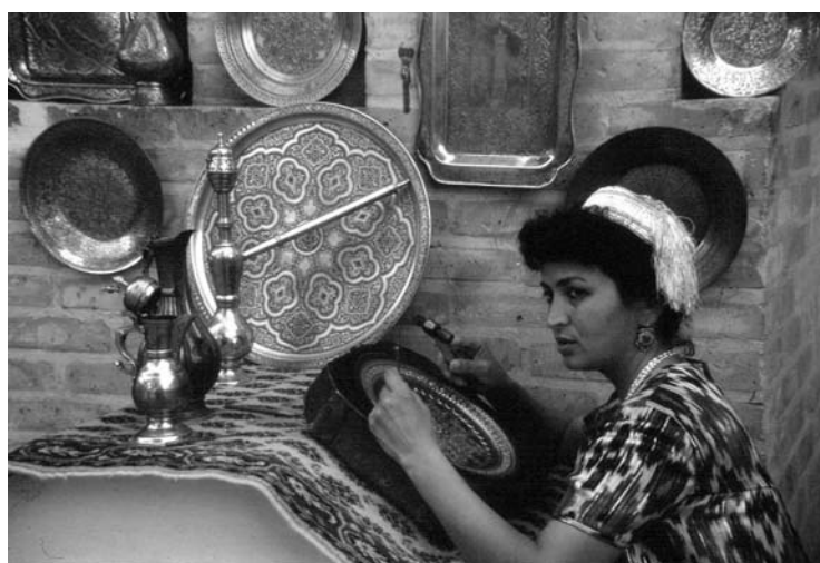
Photographs of Uzbekistan taken by Zilola Saidova are on display at the Mathers Museum of World Cultures through December. For more information on Central Eurasia in the arts, see pages 3-4.