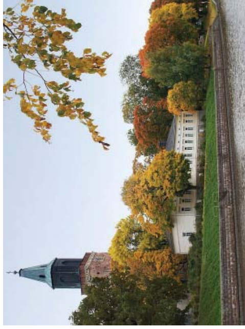
The Turku cathedral.