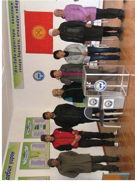
Election monitors during the October 2010 parliamentary elections in Kyrgyzstan.