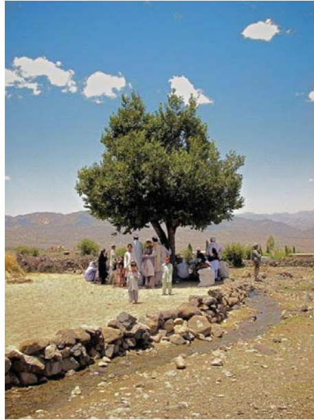
Afghans and Americans gathered for a shura (council) under a village tree.

This fall, the IAUNRC also launched its newest interactive videoconference, “The Roof of the World: Real-life Locations from Three Cups of Tea.” The New York