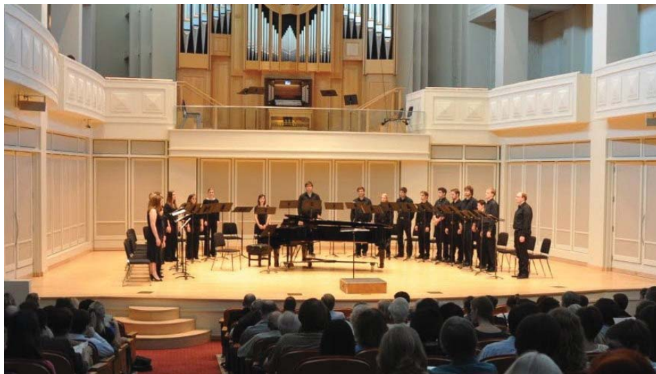
The IU Contemporary Vocal Ensemble performs Pärt.

The Pärt jubilee lecture and roundtable are available as part of the IAUNRC podcast series, which can be downloaded from the Center's website.