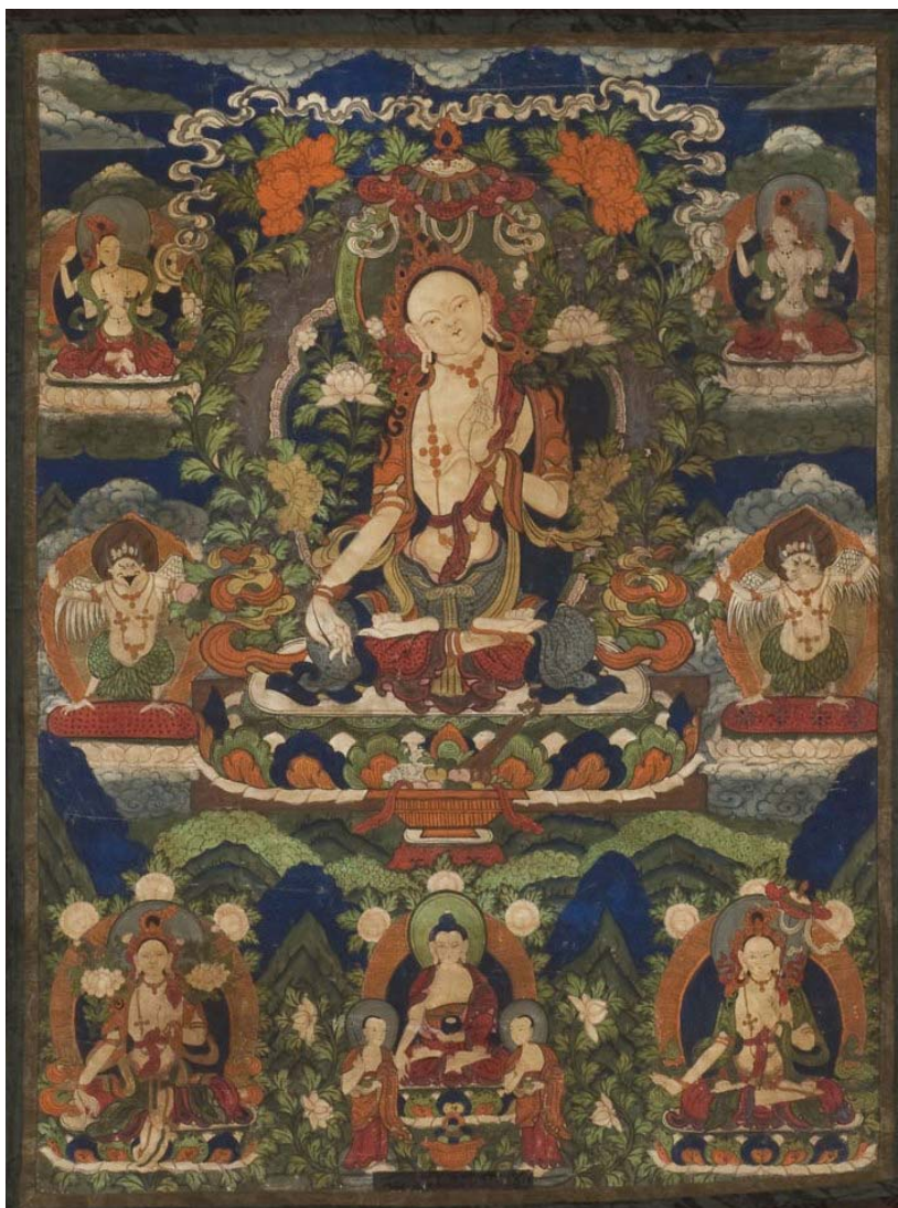
A scene from a thangka painting.

“Getting into the research on some of these pieces, I realized the tsam tradition has been largely lost in Mongolia, and our knowledge of it is very sketchy. There’s a lot of information that hasn’t been put together in a real scholarly work yet.”